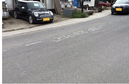
Loading Bay oppo vets