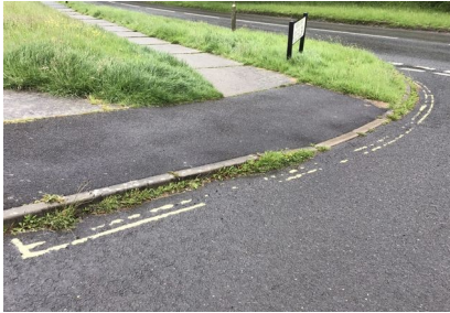
Moor View entrance